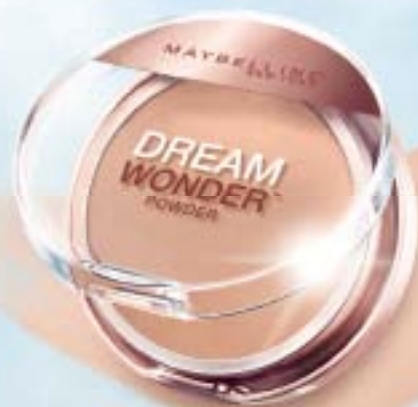
DREAM WONDER ™ POWDER Smooth-Whipped Pressed Powder Available in 16 Shades