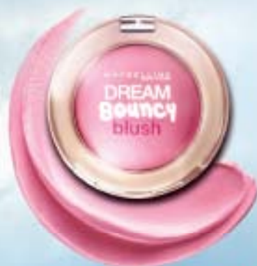
DREAM BOUNCY BLUSH ™ Lightweight Cream Powder Blush Available in 10 Shades