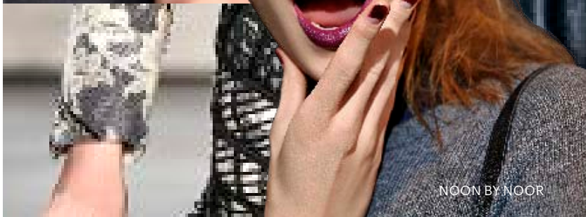
NOON BY NOOR