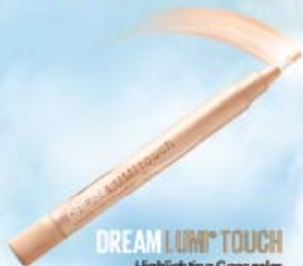
DREAMLINER ® TOUCH Highlighting Concealer Available in 6 Shades

DISCOVER FLAWLESS. EXPERIENCE THE FULL COLLECTION!